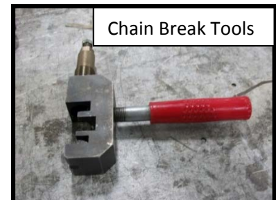
Chain Break Tools

Call or e-mail us today at Sales@Tekno.com for pricing. Our personnel will be glad to help you find the specific items that you need for your system and discuss how we can assist you.