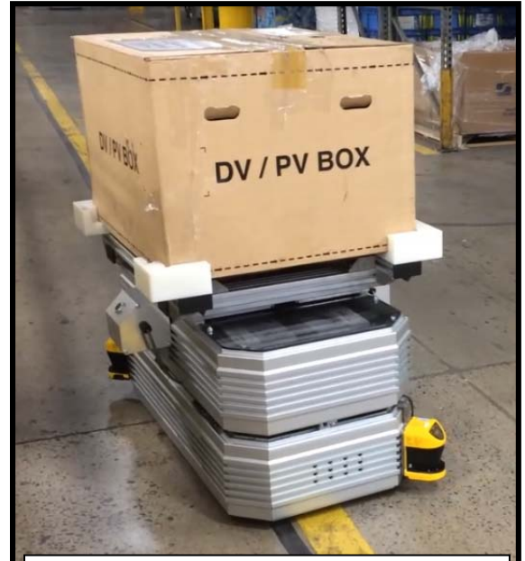
Videos available at www.tekno.com/videos