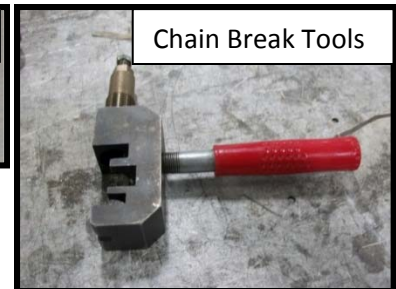
Chain Break Tools